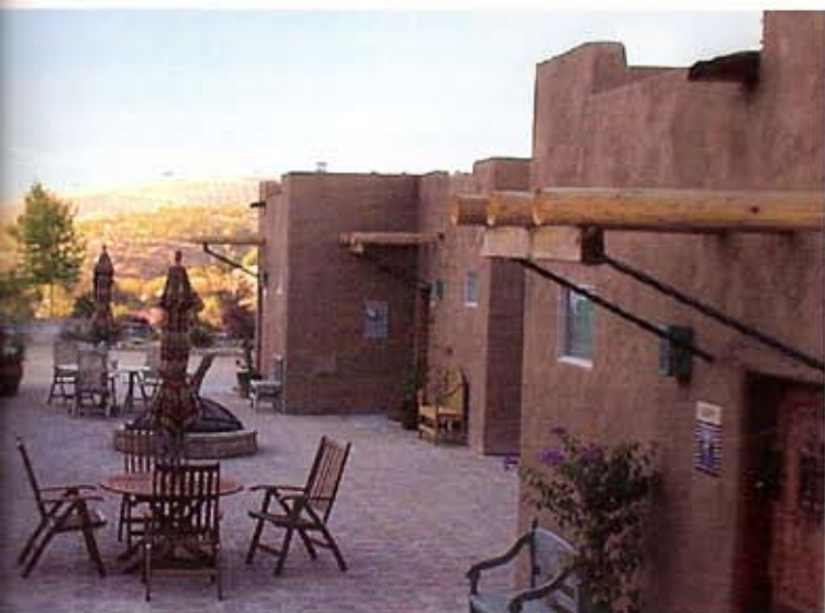
BOTTOM: WILD COYOTE IS PASO ROBLES' HIDDEN JEWEL—RIPE FOR DISCOVERY.